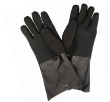
Gloves, Pair of Hot Mitts Part Number: 93349