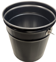
Pail, 5 Gallon with Lid Part Number: 93350