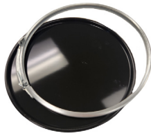
O Ring - Pail Handle Part Number: 16339