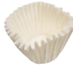
VF-3 Oil Filter Paper Part Number: 16111